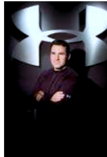
Under Armour CEO Kevin Plank and his team realized that they could leverage their moisture-wicking synthetic fabrications into new markets.

A primary challenge of creating competitive advantage with a leverage strategy is updating the resource portfolio as industries change. This can mean choosing whether to acquire, partner or develop key resources in-house. Toyota's Prius is an example of leveraging some existing resources, including brand and electronics technology, even as the company developed and acquired new resources for hybrid technology, engine control software and regenerative braking. But, even when managers see the need for adding, upgrading or eliminating resources, entrenched beliefs and internal power struggles can interfere. Immediate performance from existing resources takes precedence over later performance from new resources that may be several years away. To support this point, one needs to look no further than Chrysler. In 1984, Chrysler introduced the first minivan. Over the next 20 years, it sold more than 10 million minivans, revitalized its popular Jeep line and introduced successful Ram and Dakota pickups and Dodge Durango SUVs. But the auto industry changed. While General Motors and Ford adapted their engine technologies to emphasize fuel efficiency